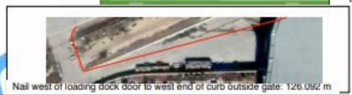
Nail west of loading dock door to west end of curb outside gate: 126.092 m